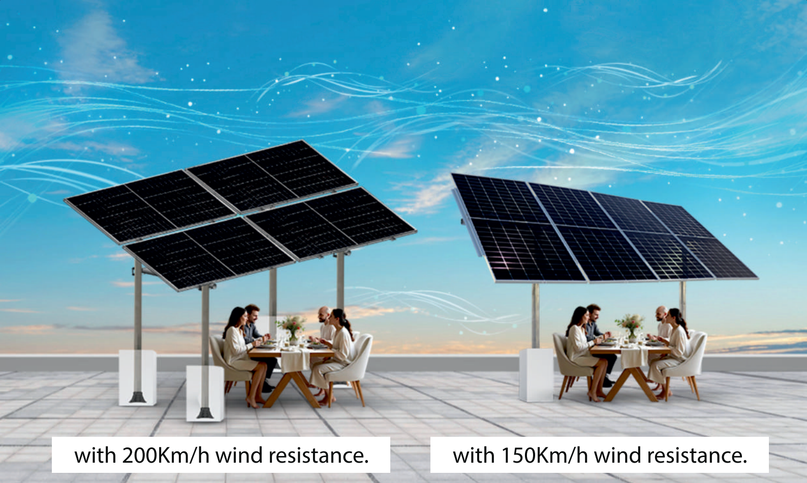
with 200Km/h wind resistance.