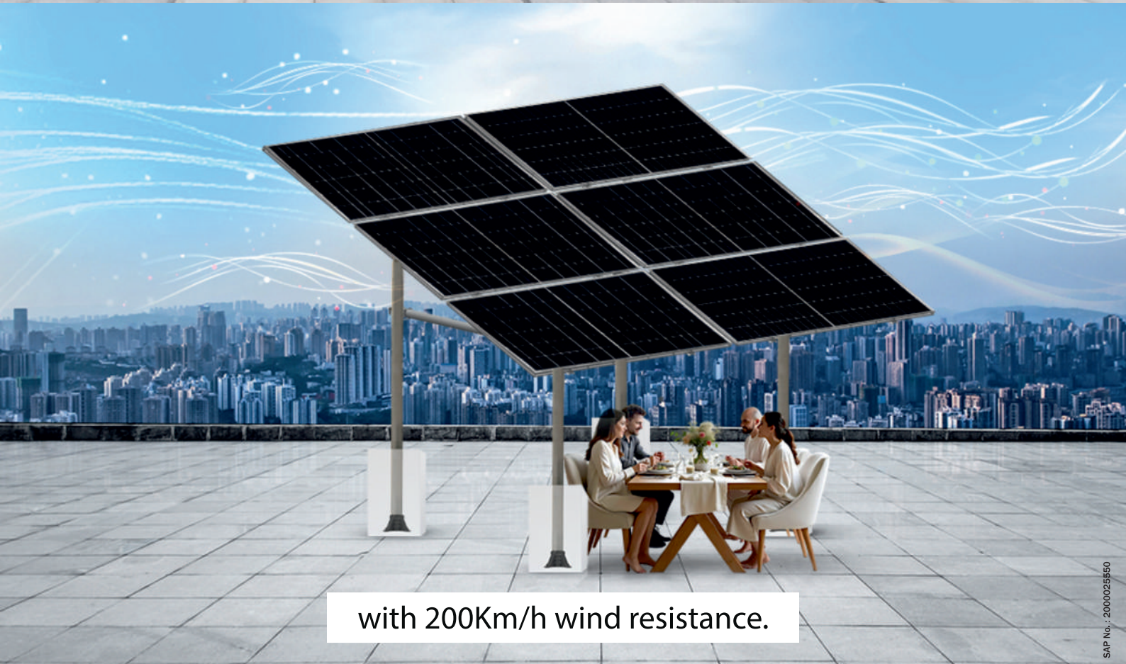
with 200Km/h wind resistance.