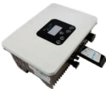
Inverter with RMS